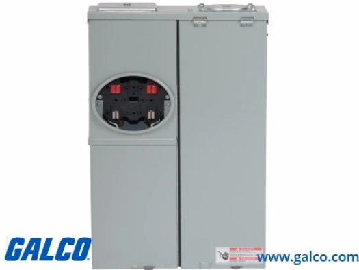
GRID = 1 Inch