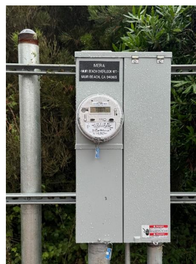
PG&E meter installed at Muir Beach Site.