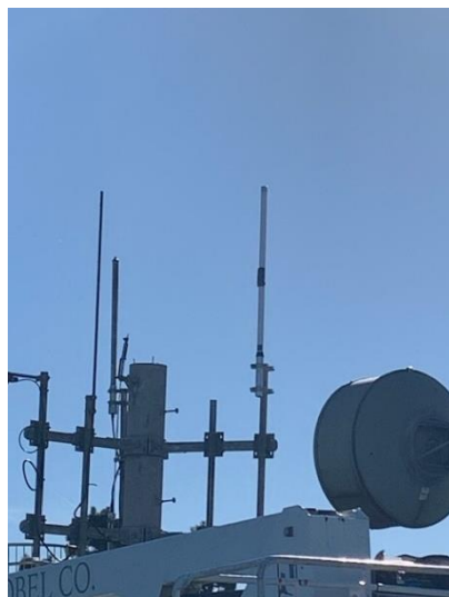
Radio antenna work at the Pt Reyes Site.

Motorola trainers will be in Marin the week of February 19 to conduct Train the Trainer sessions for Dispatchers and Field users.