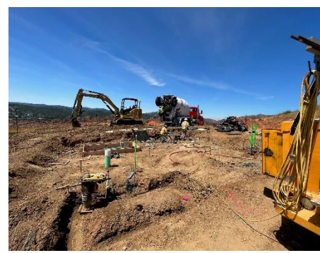
Construction at Skyview