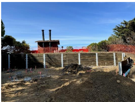
Construction at Muir Beach